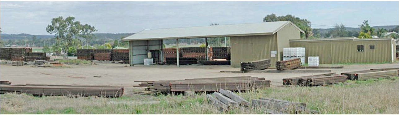
Ex-Pig and Calf Yard, now part of the timber yard (above and below). The pole storage yard (below) is to the right and beyond the building above.