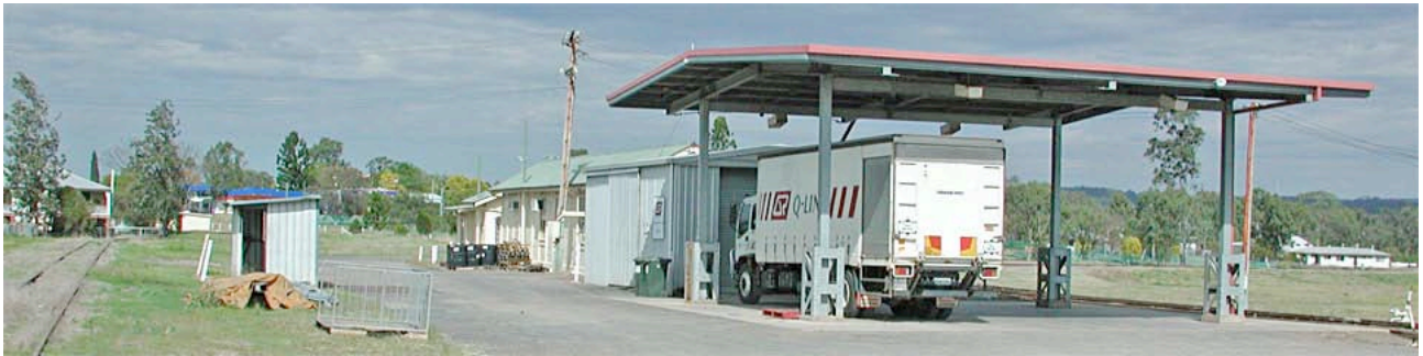
Weighbridge (left), Monto station (centre) and Q-Link freight (road transport) terminal (right).

Monto yard as it existed some years ago when the town was a major QR centre with loco shed and crew accommodation. A survey for a line to Biloelia was done but the line was never built. Drawing not to scale.