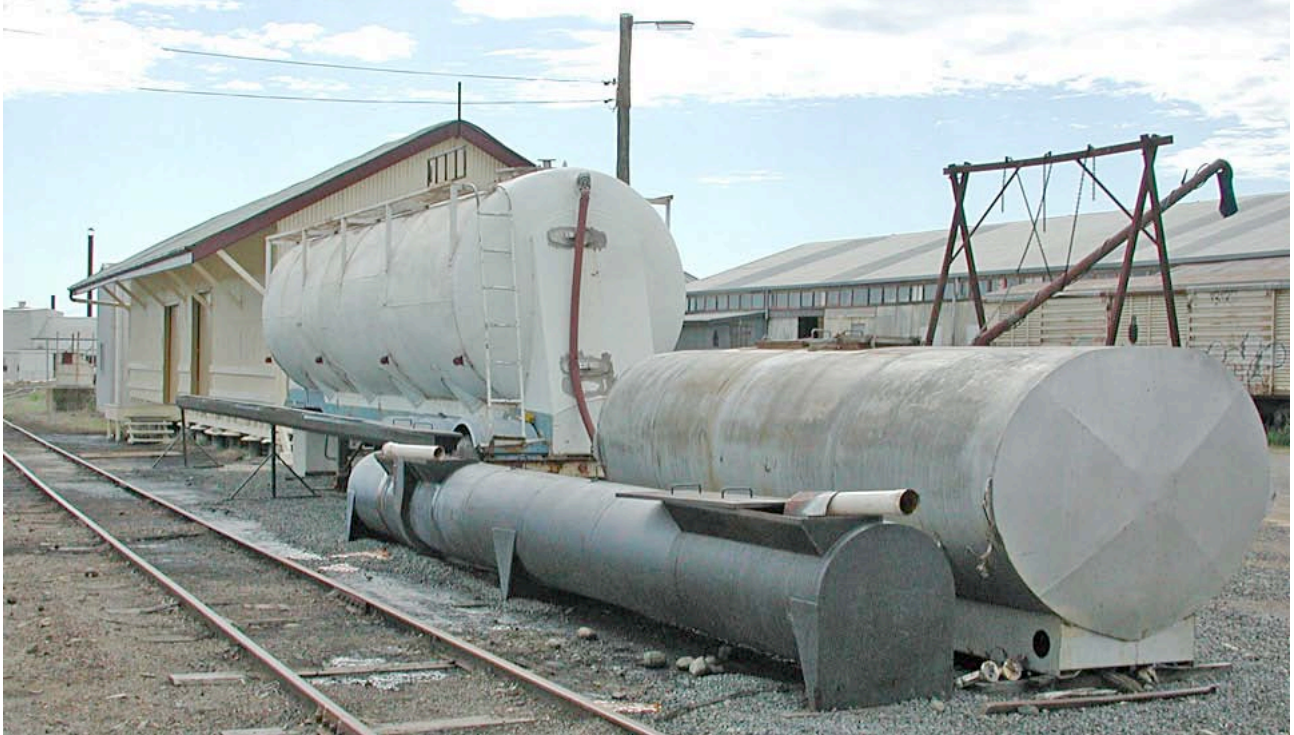
Standard large goods shed (above and on following page). Note the bulk product handling facilities, general clutter and the modern metal shed (far end).