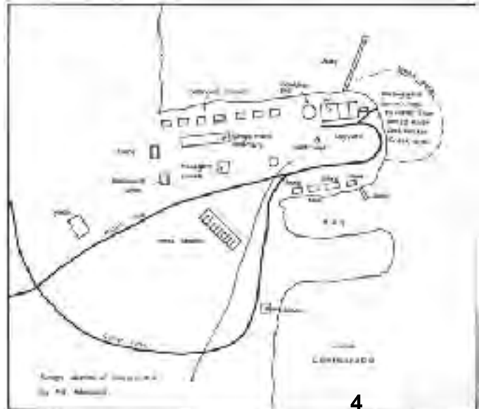
Above: Innisfail Tramway