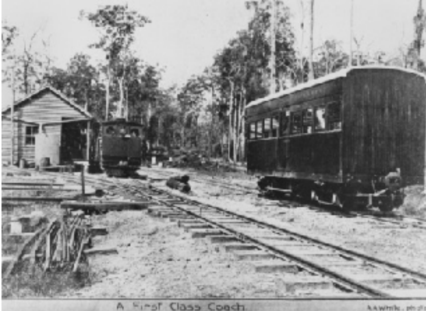
Below: Cooloola Tramway - look familiar!