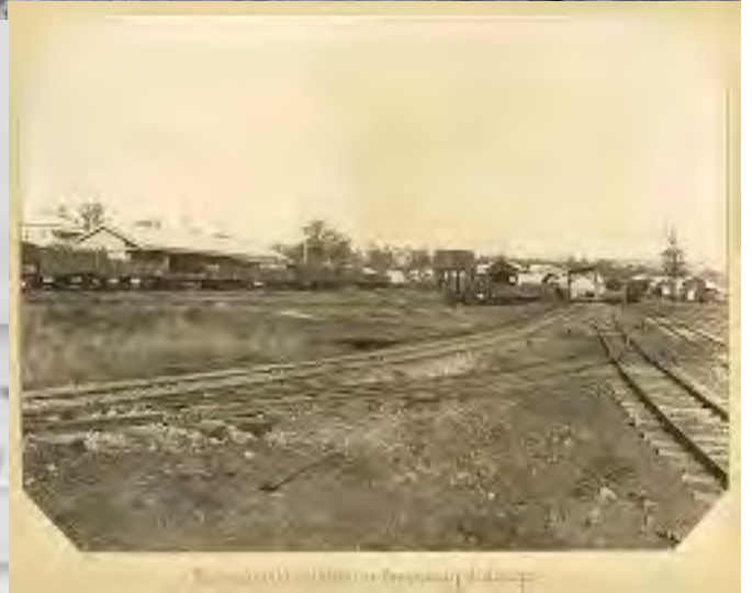
Above: Beaudesert Station and Yard