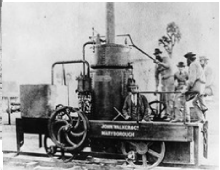
Left: Mapleton Tramway