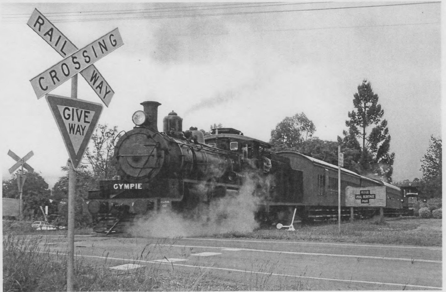
C 17 #802 departing Imbil – 18 th February 2007.