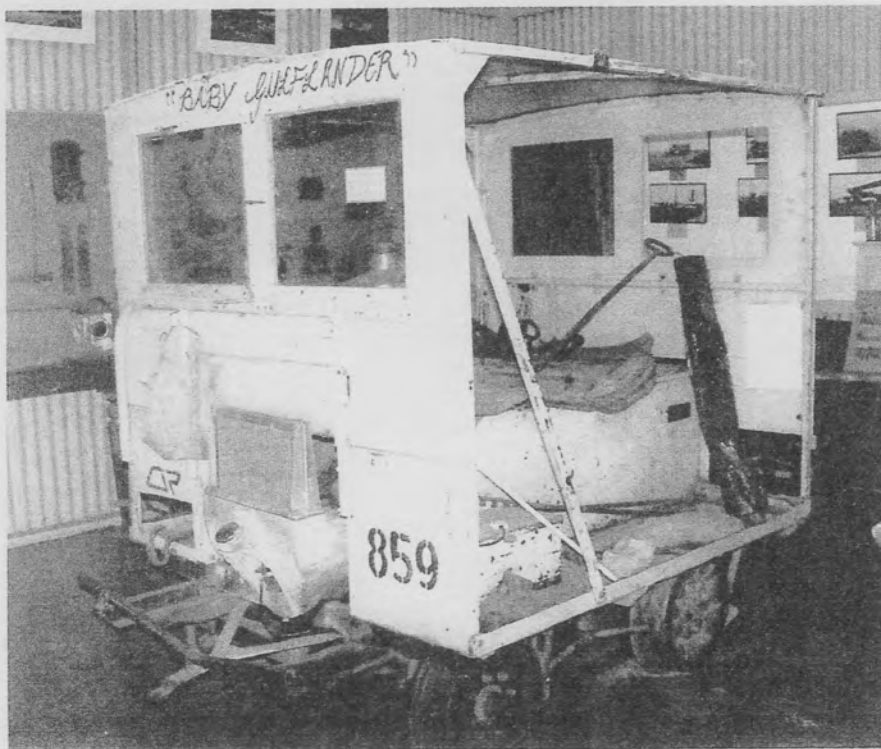
Motorised Trolley ('Baby Gulflander') at Normanton.