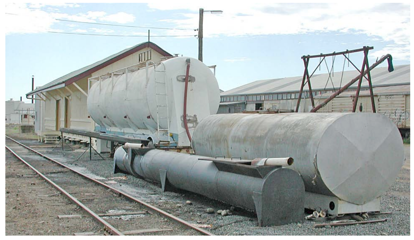
Standard large goods shed (above and on following page). Note the bulk product handling facilities, general clutter and the modern metal shed (far end).