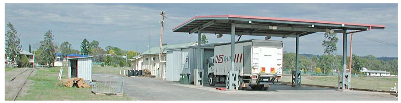
Weighbridge (left), Monto station (centre) and Q-Link freight (road transport) terminal (right).

Monto yard as it existed some years ago when the town was a major QR centre with loco shed and crew accommodation. A survey for a line to Biloelia was done but the line was never built. Drawing not to scale.