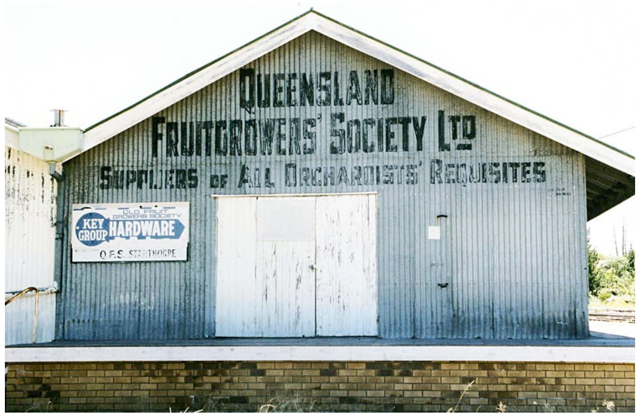
\label{thm:condition} \mbox{Queensland Fruitgrowers' Society building in the Stanthorpe yard.}