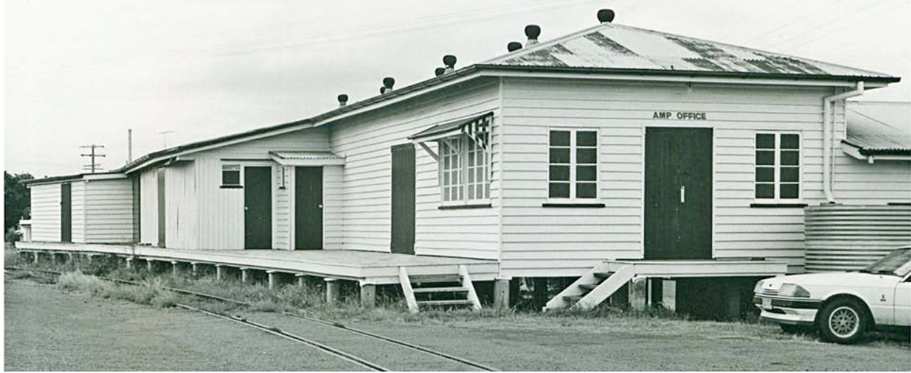
Two groups of freight sheds at Lowood, 1989 (top) and 1995 (above).