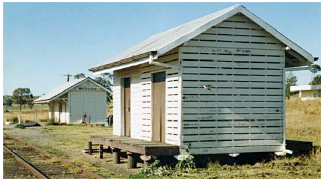
Combined cream and goods shed, Mulgildie (Monto loop) 1996.