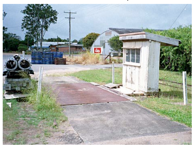
Atherton weighbridge, 1993. For modelling purposes, it is approximately 6' from the base to the eave. Lynn Zelmer photo.