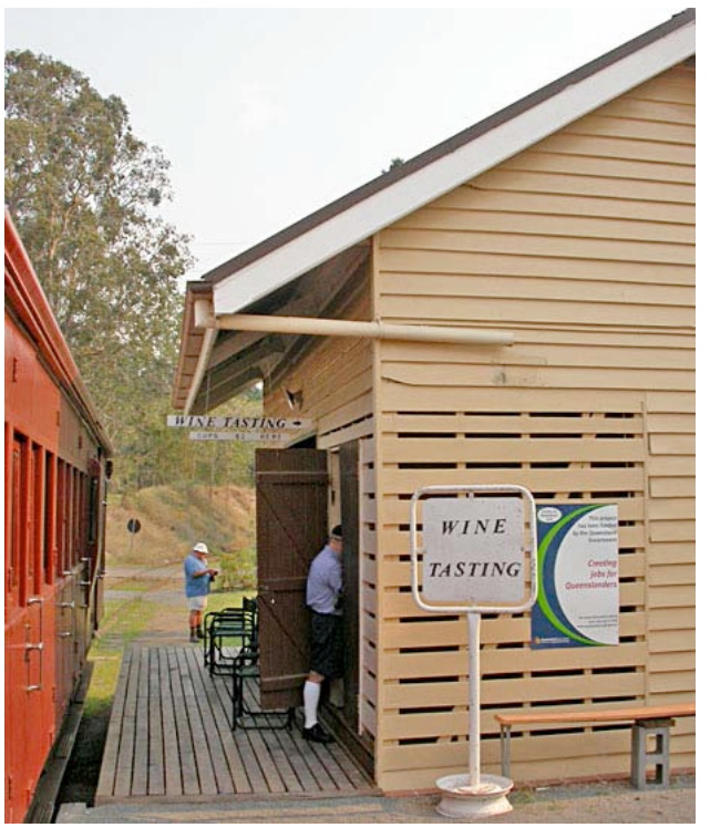
Dagun goods and cream shed, 2004, being used for wine tasting on the Mary Valley Rattler tours.

Roof styles and covering varied by locality and era. Small simple skillion-roofed sheds were to be found along the main line south to Wallangarra, including those at Dalveen and The Summit.