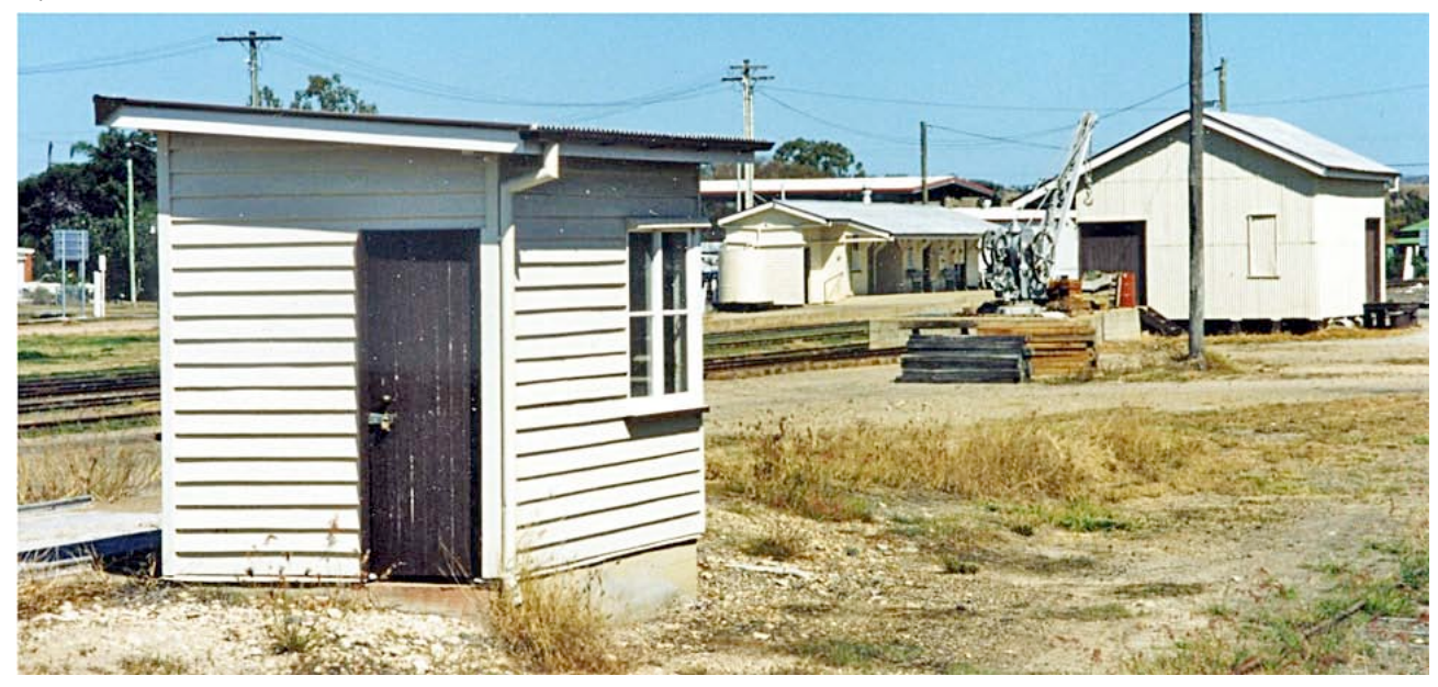
Gayndah Weighbridge and Yard, 1996. Likely there is another large window on the weighbridge side.