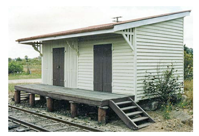
The Summit combined goods and cream shed 1996 with a decorative timber shade.