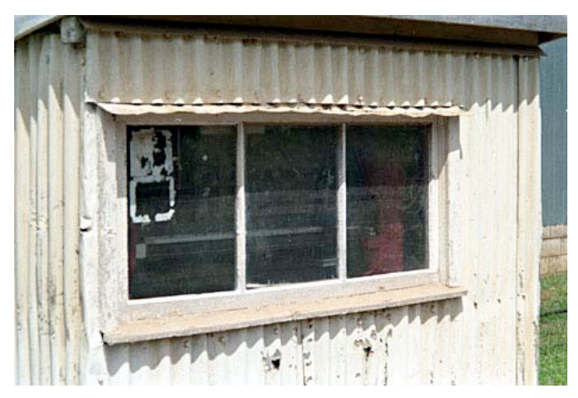
Atherton weighbridge (above and below), 1993. The scale is barely visible in the window above. HO modellers could use the scale mechanism from the Woodland Scenics Trackside Scale. The back of the shed below swings open for operating the scale.