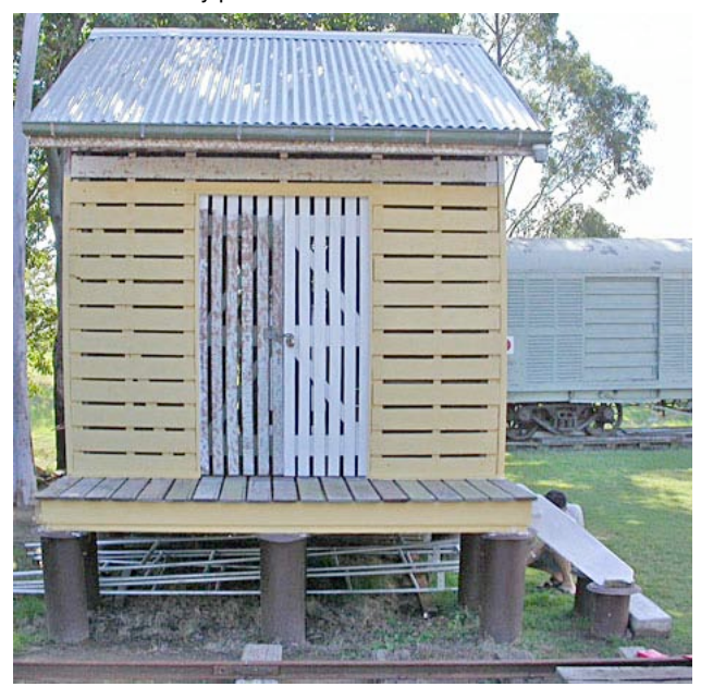
When the building was reassembled it was apparently installed back to front on the stumps, however both back and front appear to be reasonably identical. 2005 during restoration.

Dimensions were obtained during restoration. The building itself is square (10' 2" x 10' 2") on a 10' 2" x 16' 6" platform (platform floor boards extend roughly 1" over the edge, increasing the apparent dimensions slightly). The timber for construction of such buildings was painted but not planed and any smoothing came from wear. Exterior wall boards are 1" x 6" with a 1" space between. Interior wall boards appear to be 1" x 4" or 1" x 3" and are placed so that they cover the exterior openings.