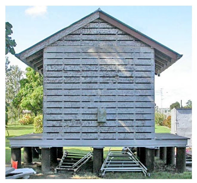
End view during restoration, 2005. This is the opposite end to the water tank in the original site due to the shed being turned around during restoration.

The building was undercoated in white and then painted in QR yellow to match other museum buildings. Downspouts and the restored station sign, etc., have also been fitted.