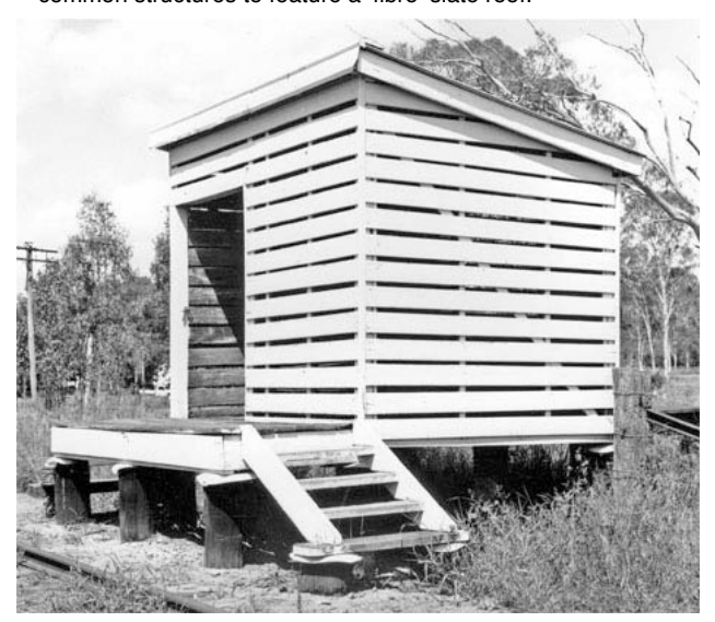
The shed at Moore, further north on the same line, would have been one of the smallest sheds, being maybe no more than 7'0" square in plan.