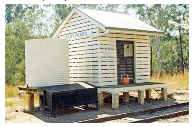
In 1996, along the Monto loop, Many Peaks' cream shed remained as the only railway building, apparently fulfilling the role of goods shed (and any other function). An accompanying tank was a common feature of these structures throughout the system.