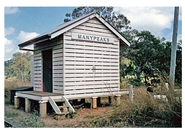
The opposite end of the Many Peaks cream shed some time prior to its removal to North Bundaberg. Note the diagonal bracing visible under the siding. The gray patch on the side appears to be the location of a power panel; the electrical conduit is visible to the left of the stump.

The Many Peaks cream shed sat disassembled for several years but was restored as the Bundaberg Railway Historical Society's major project for 2005.