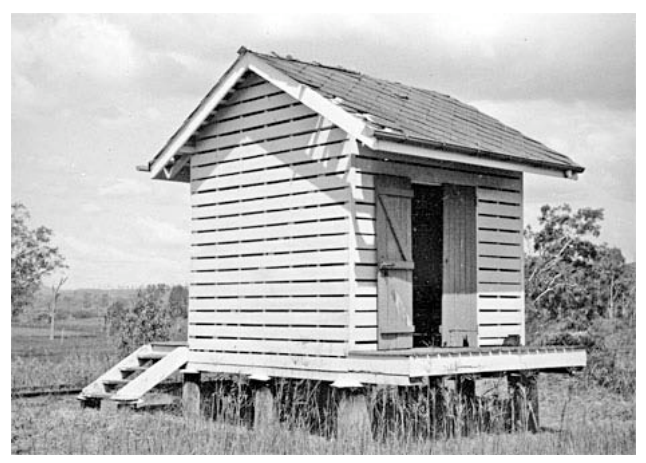
Nurinda on the Brisbane Valley branch, exemplified the typical standard cream shed, but it was also one of the less common structures to feature a 'fibro' slate roof.