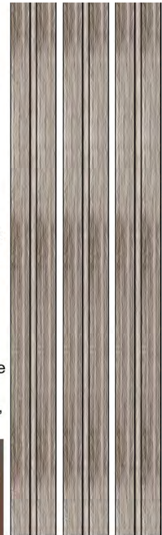
Timber (above) for underframe, steps