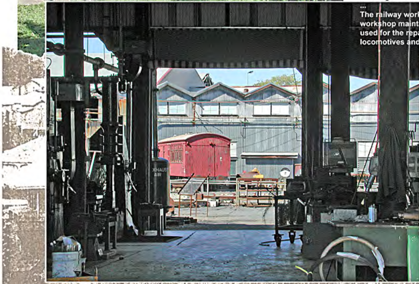
Image: Rocky's 360 Roundhouse; Railways of Australia NETWORK, April-May-June-1993, p46-7