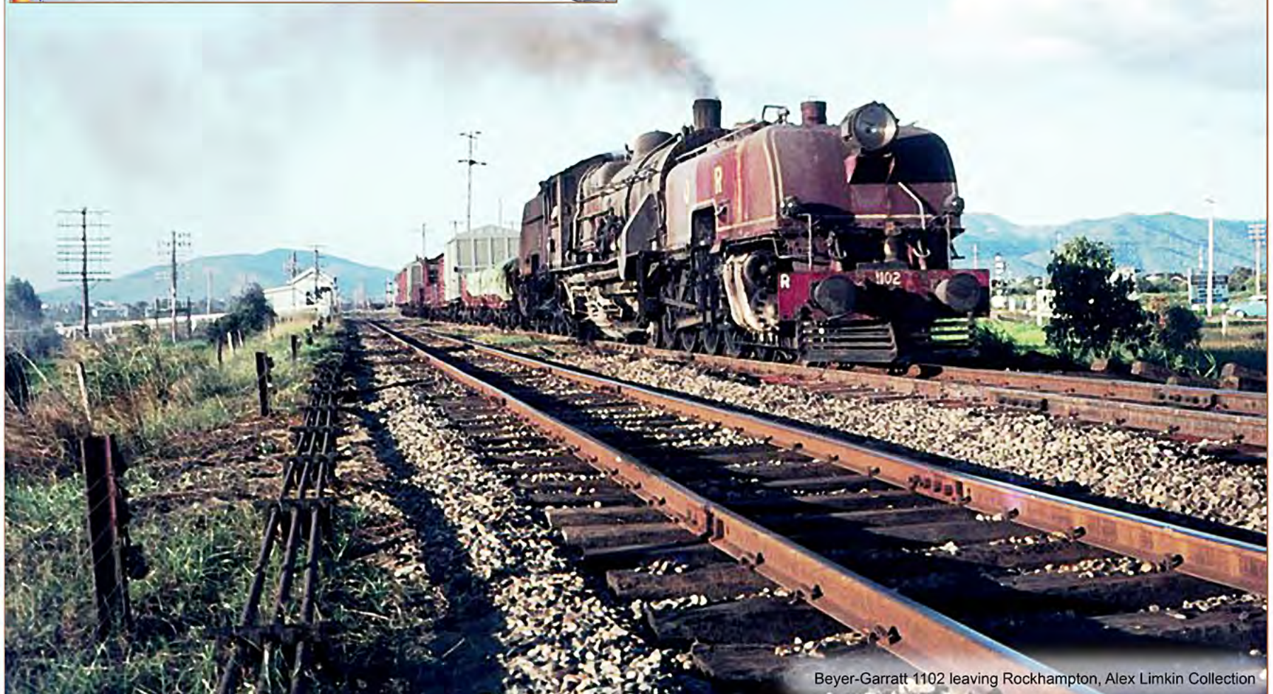
Beyer-Garratt 1102 leaving Rockhampton