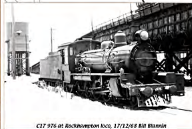
C17 976 at Rockhampton loco, 17/12/68 Bill Blannin