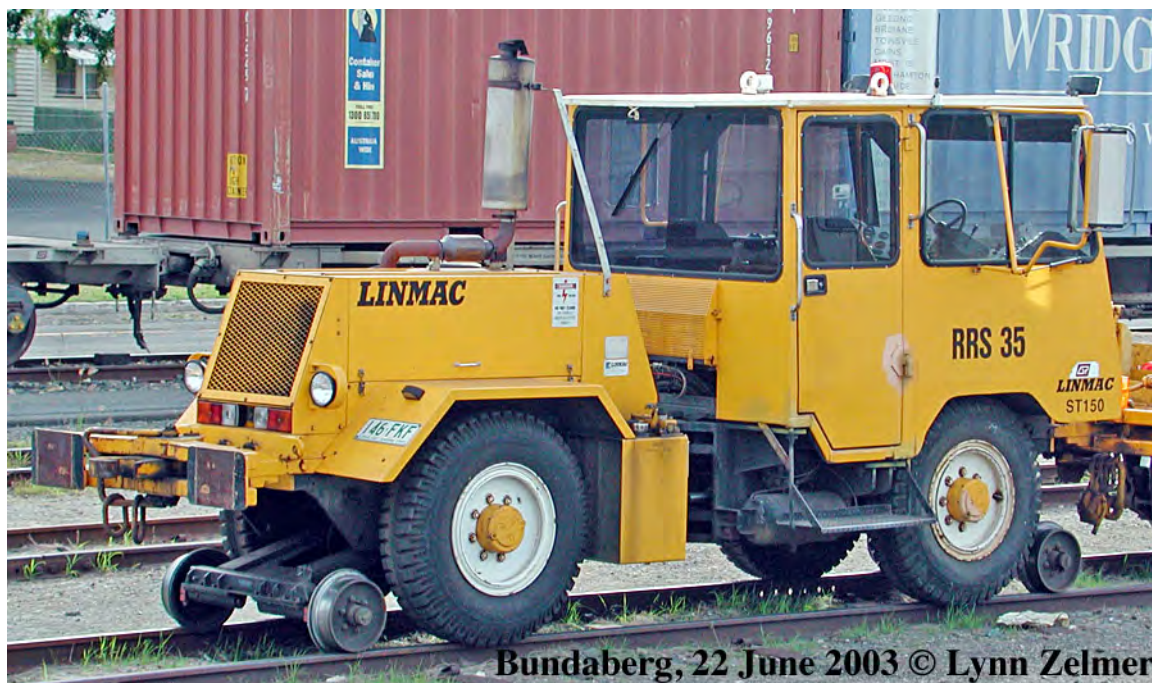
Bundaberg, 22 June 2003