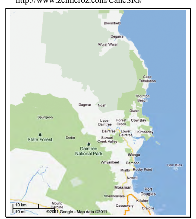
Google Maps image showing location of the Bloomfield River (top centre) relative to Mossman and Port Douglas (lower right), a distance of roughly 68 km as a crow flies. [110921]

http://QldRailHeritage.com/mrqc/ or http://www.zelmeroz.com/CaneSIG/