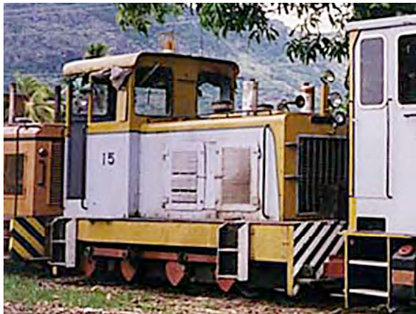
Fiji Oct/Nov 1994: No 15 (0-6-0DH, Baguley-Drewry 3662 of 1971).

Queensland Rail (Innisfail Tramway) loco Mourilyan DL12 (0-6-0DM Baguley/RMP 3390 of 1954) is being restored. Photo: http://www.lmlr.org.au/locomotives/index.htm