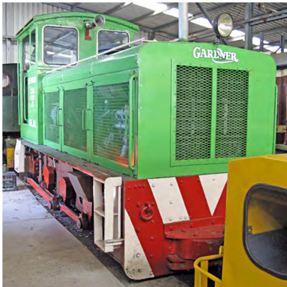
ILRMS: ex-CSR Victoria Mill 'Seymour' (0-6-0 DM Baguley/Drewry 2392 of 1952) at Illawarra Light Railway Museum Society, Albion Park NSW, 9 April 2009.