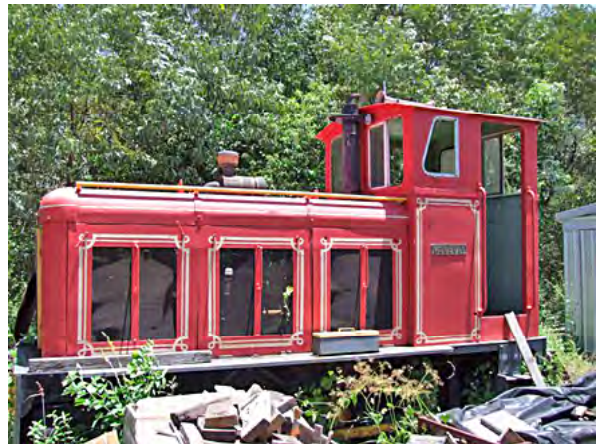
Preserved ex-Mossman Mill, 'Mowbray' (0-6-0DM, Baguley/RMP 3378 of 1954) at Bally Hooley, Port Douglas, March 2009.