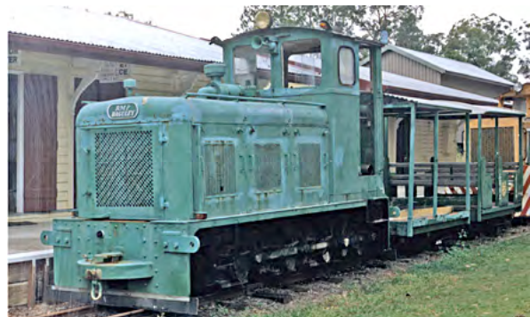
Ex-Mulgrave Mill No 1 (0-6-0DM Baguley/RMP 3377 of 1953), with two St Helena Island tourist carriages at Woodford, June 2004. ANGRMS is currently restoring the locomotive.