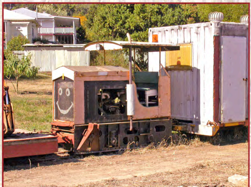
BELOW: Moreton Mill's 'Jlimpy' (Malcolm Moore 4wDH 1051 of 1943) on the navy train taking up the track following the mill's closure. Note the re-railer hung on the side of the frame and the non-standard roof design. Photographed on 6 August 2004.