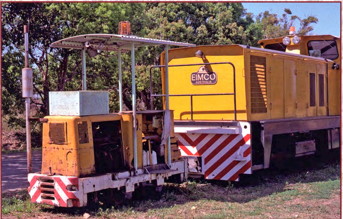
BELOW: Early diesel to modern: Fairymead #9 (Ruston and Hornsby 4wDM 339311 of 1953) at Fairymead Mill in 1990. The fourth generation mainline locomotive behind (Eimco B-B DH L254 of 1990) subsequently went north to become Farleigh Mill's 'Farleigh'.