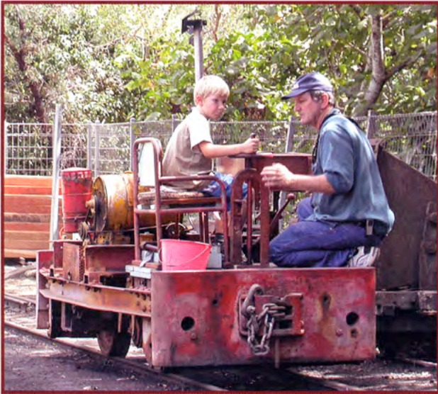
ABOVE: Planet (Hibberd 4wDM 3919 of 1959) in navy duty at the Australian Sugar Cane Railway, Bundaberg. The locomotive has since been remotored and equipped back and front with large tool boxes as it was in service with Bingera Mill.