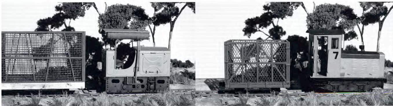
ABOVE: The 7mm Malcolm Moore 4wDM (left) with a 7mm 4 ton cane bin was scratch-built in brass by John Burgess. The cab height on the 1/4" scratch-built 4wDM inspired by the Comeng Model G (right) is roughly one scale foot too short for an accurate model. It has a styrene body on a Boulder Valley chassis and is followed by an 1/4" 4 ton cane bin. Compare the relative sizes of the bins: these two images were taken at the same location and camera settings, and illustrate the roughly 10% size difference between the two 'O' scale/gauge combinations popular with cane modellers: On16.5 (7mm scale, 1:43) and On30 (1/4" scale, 1:48). On24 (or On2) modellers are much less common and must scratchbuild mechanisms as well as superstructures.