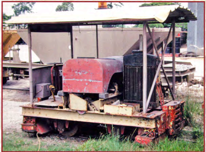
ABOVE: Simplex 'Smokey' (Motor Rail Ltd 4wDH 4054 of 1926, originally petrol) with its distinctive longitudinal radiator at Victoria Mill, 26 October 1996. Note the end buffer with its choice of coupling heights. In the 2000 locomotive list, Victoria Mill still had two operational Simplex 4wDH locomotives and a third had been converted to an unpowered ballast plough. By 2001 'Smokey' had been sold to a mill worker and dismantled to salvage the Dorman diesel engine.

This article is the first of a series describing the several generations of internal combustion locomotives operating in Queensland canefields. Articles to follow will describe the four generations of mainline canefield diesel locomotives.