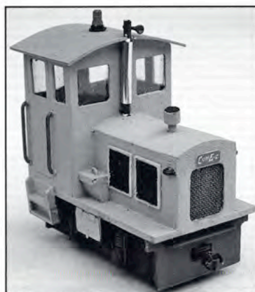
Comeng Model G in 7mm scale (On16.5, 1:43), built by John Armstrong. The chassis was cast as a Brisbane model club project, individual models reflect the skills of the modeller.