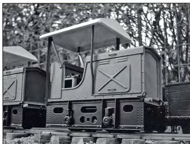
BELOW: Malcolm Moore 4wDM in 16mm scale (SM32, 1:19), available from Tootle Engineering. Tim Boulton, modelmaker and photographer.

The side rods on 0-4-0 internal combustion locomotives pose more of a challenge but the On30 Bachmann 4wPM model provides a good starting point for kit-bashing.