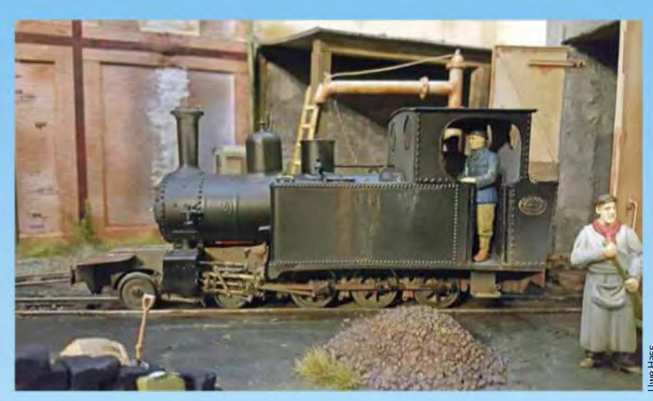
A steam locomotive, and a Baldwin 4-6-0 T at that! This is the Scale Link model.

UW : I used buildings from the MiniArt range. Either complete ones for the houses in the village, or by using just a few parts to build the large factory, for example. I also built several using large plastic sheets and many types of strips, as well as sheets of Styrofoam. The structures are then carefully painted with acrylics, before being weathered using various techniques and many very fine pastel-based products. The figures are from the MiniArt and MK35 ranges.