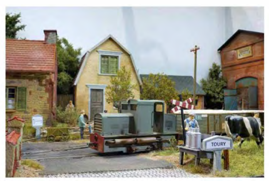
The T 75 D is seen hauling a four-wheeler open wagon through the village.

The Toury sugar mill depot in 1/35 scale. Two locotractors. from two successive wars. are shunting in the yard. In the foreground. a Campagne. under the shed a Billard T 75 D. Both are resin kits from the V-Models range.