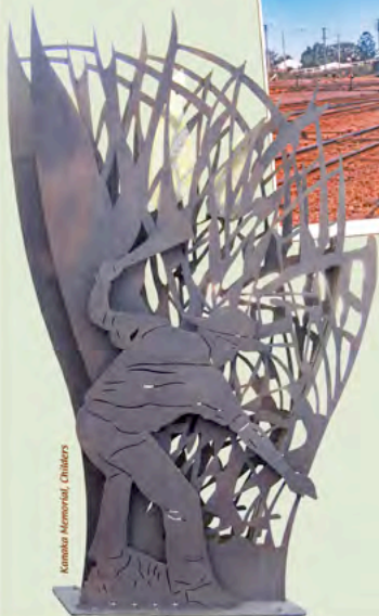
Kiamuk Memorial, Childers