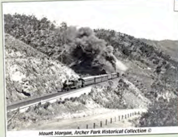
Mount Morgan.