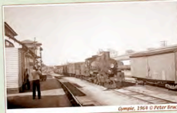
Gympie, 1964