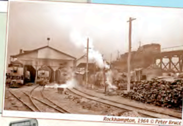
Rockhampton, 1964