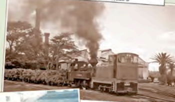
Moreton Mill, 1964