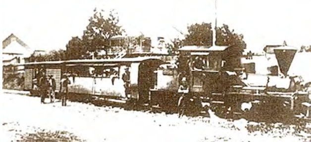
A passenger train on the Mapleton Tramway

In 1921, it is recorded that the Mapleton Tramway had two passenger carriages and 11 goods and livestock wagons. The passenger carriages were similar to those used on the Moreton Mill tramway systems and the other half was open for the carriage of cream cans and other commodities.