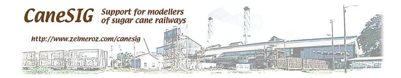
All photographs © Lynn Zelmer, September 2008.