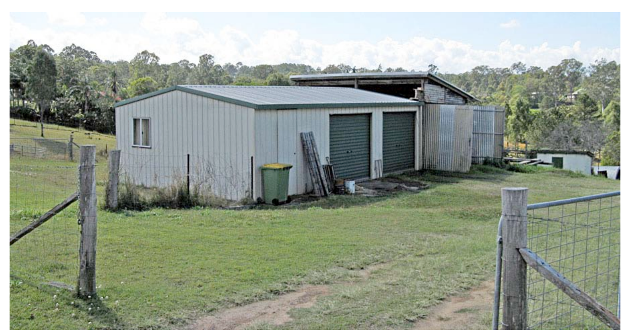
Small scale farm or workshop buildings (above). Note that doors are high enough for either medium-sized trucks or agricultural machinery. The far shed with its sloping roof and swinging

doors is much older than the closer shed with its roller doors.